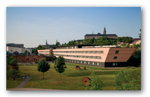
Welcome Kongresshotel Bamberg